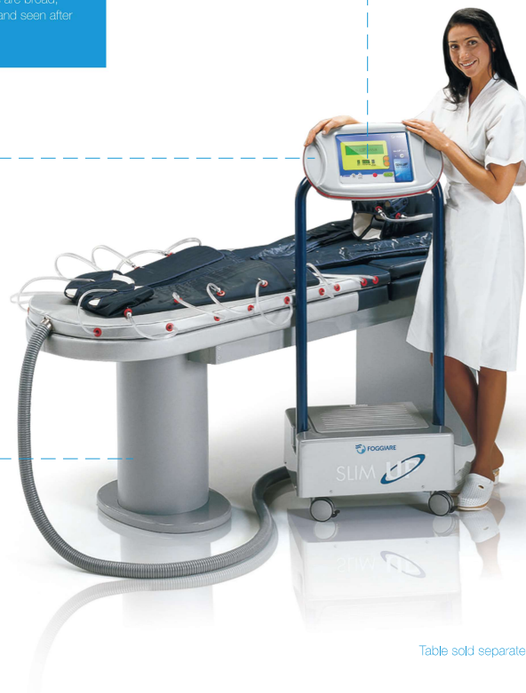
Table sold separately

The Slim Up Drain uses a "Sea Wave" system comprised of overlapping segments that are sequentially inflated (before the previous one is completely deflated), allowing for selective, progressive pressure that is uninterrupted for optimal efficacy.